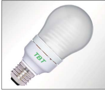
Cold Cathode Fluorescent Lamp