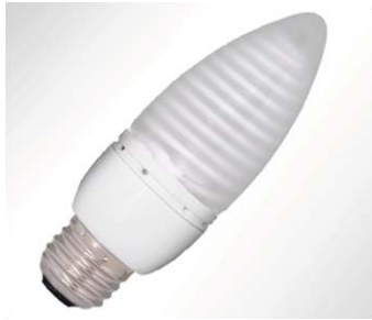
Cold Cathode Fluorescent Lamp